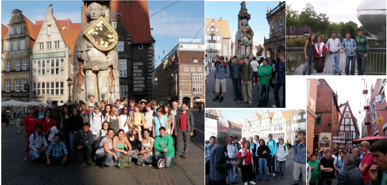
Bremen: Guided City Tour; Universum