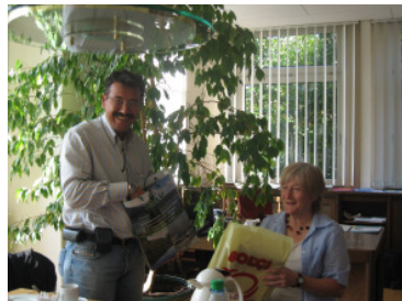
Students and teachers at school and in the city hall